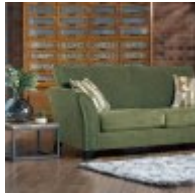
2 Seat Sofa (Standard Back)