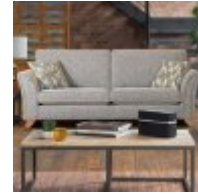
Grand Sofa (Standard Back)