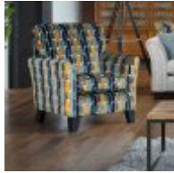
Gallery Accent Chair