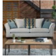
Grand Sofa (Pillow Back)