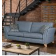
3 Seat Sofa (Standard Back)