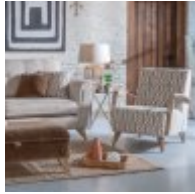
Idaho Accent Chair