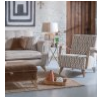
Idaho Accent Chair