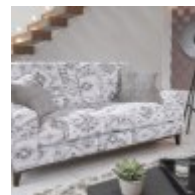
3 Seat Sofa